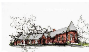
The Bill Library View of Main Entrance